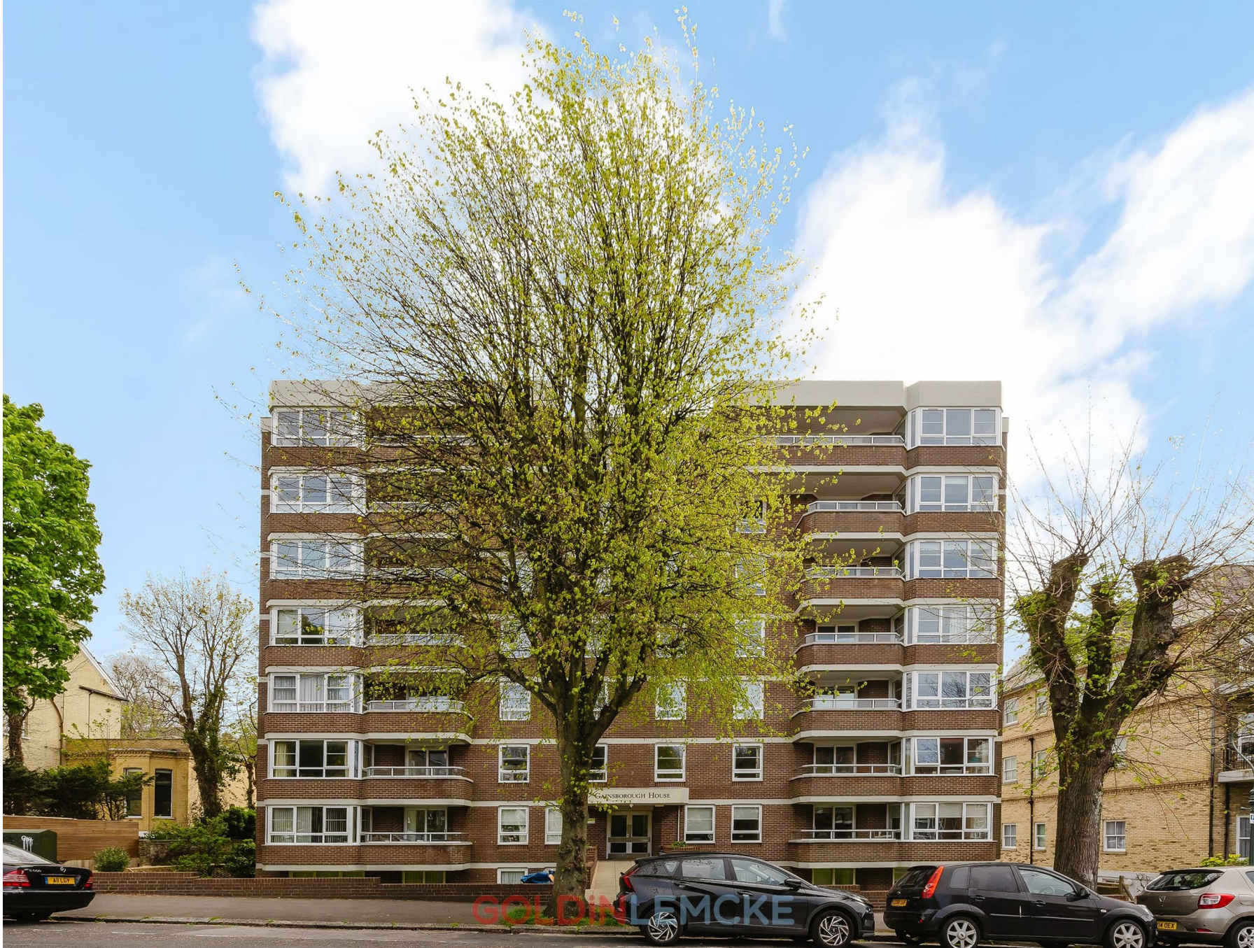
Gainsborough House, Eaton Gardens, Hove, BN3 3UA £575,000 - £595,000 Guide